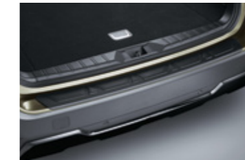
Rear Step Panel