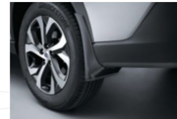
Mud Flap Set*