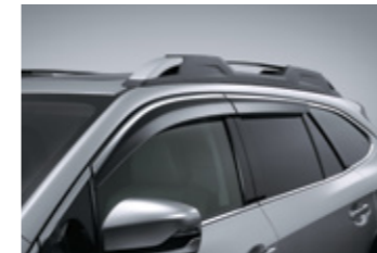
Window Weather Shield