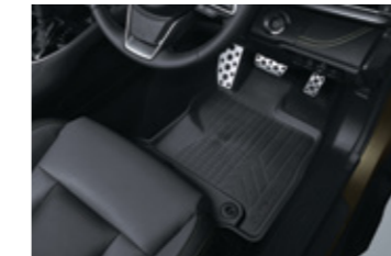
Rubber Mat Set